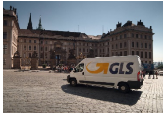
GLS delivery van in Prague (Czech Republic)