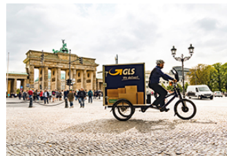
Delivery by eBike in Berlin