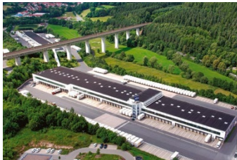
European hub in Neuenstein (Germany)