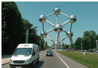
GLS delivery van in Belgium