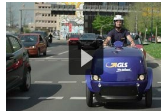
eMobility at GLS